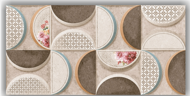
HL - 4081