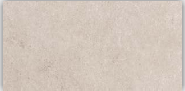
DK - 4080