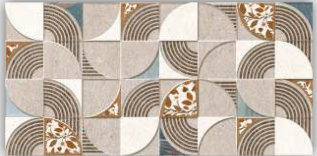
HL - 4080