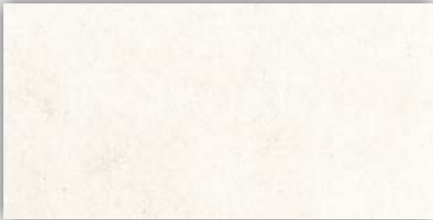
LT - 4080