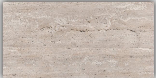
DK - 4055