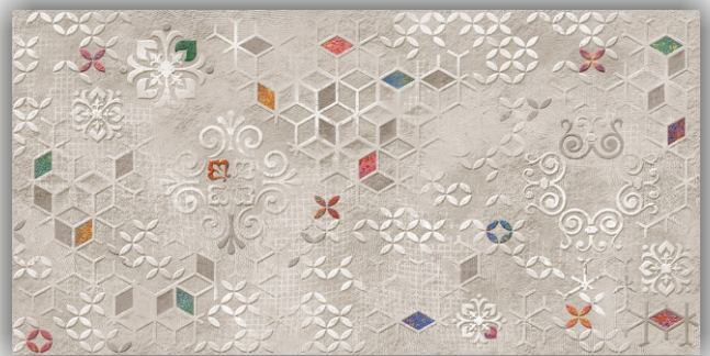
HL - 4052