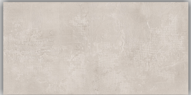
DK - 4052