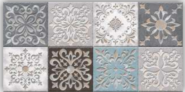
HL - 4027