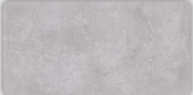
DK - 4027