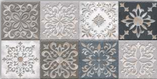
HL - 4027