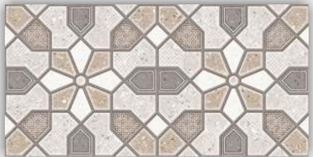
HL - 4012