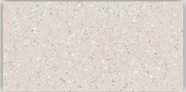
DK - 4012