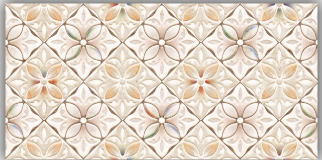
HL - 1204