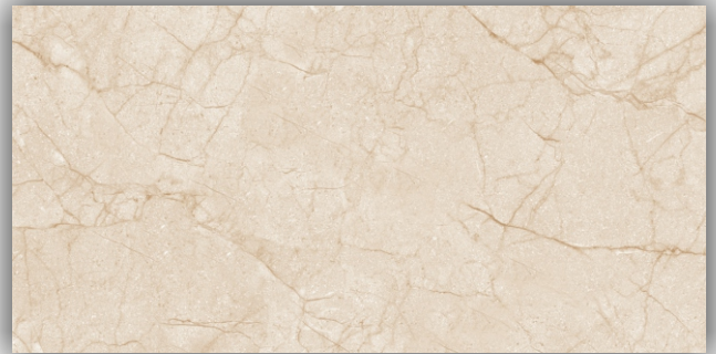
DK - 1204