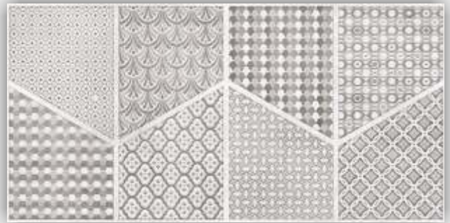
HL - 1196