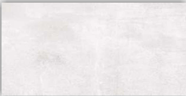
LT - 1196