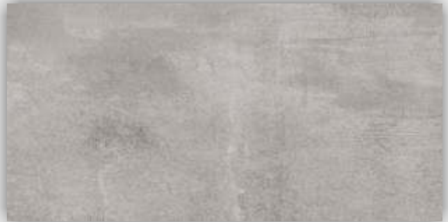
DK - 1196