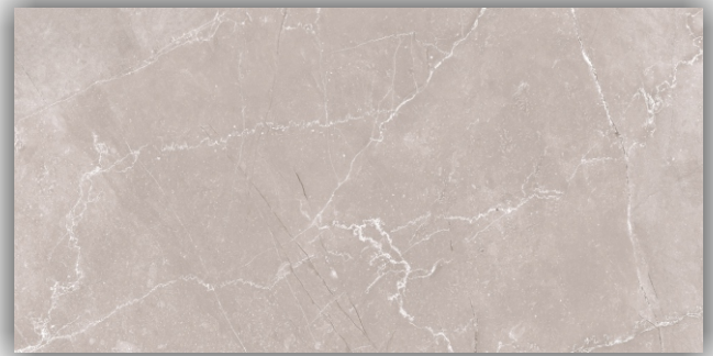
DK - 1190