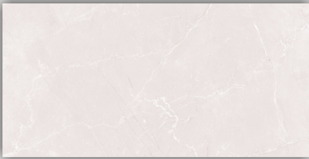
LT - 1190