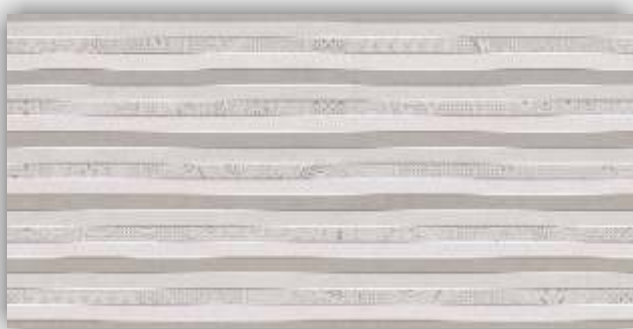
HL - 1188