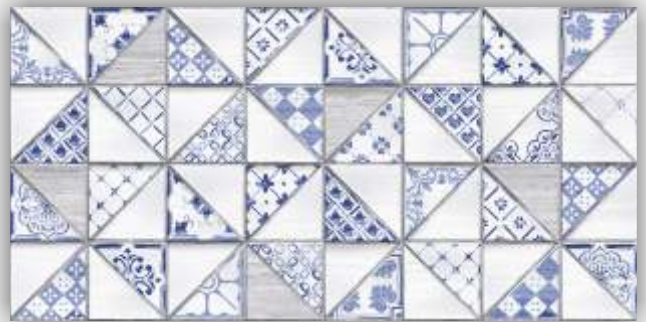
HL - 1153