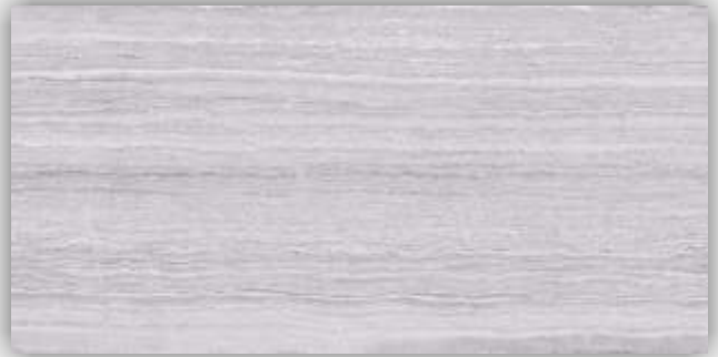
DK - 1153