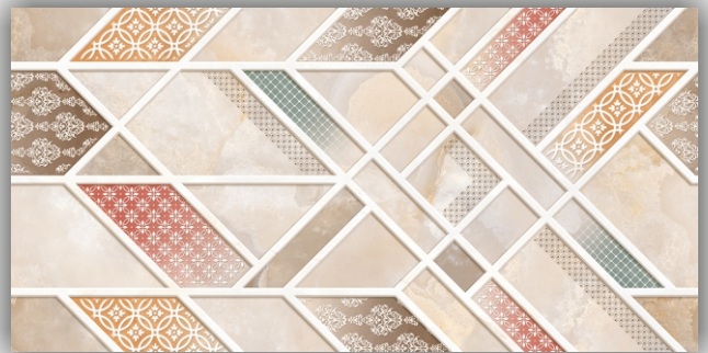
HL - 1150