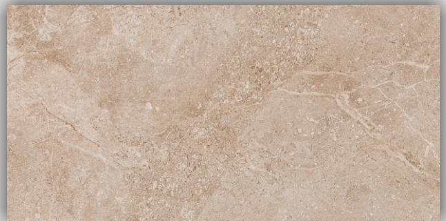
DK - 1122