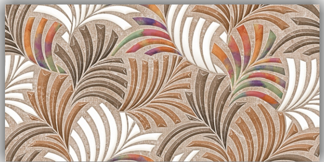
HL - 1122