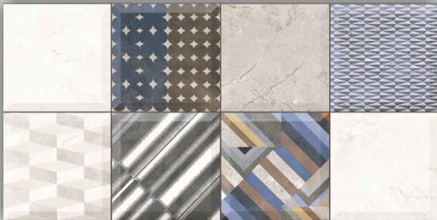
HL - 1080