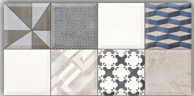
HL - 1080