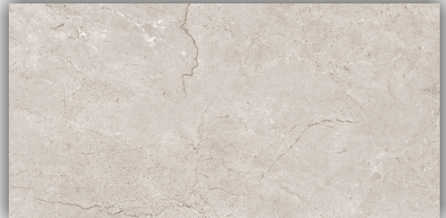
DK - 1080