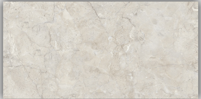
DK - 1079