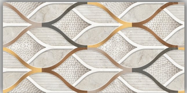
HL - 1079