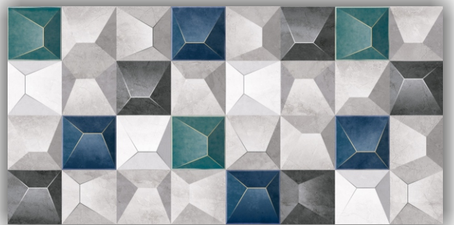
HL - 1074