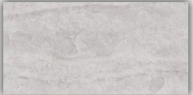
DK - 1074