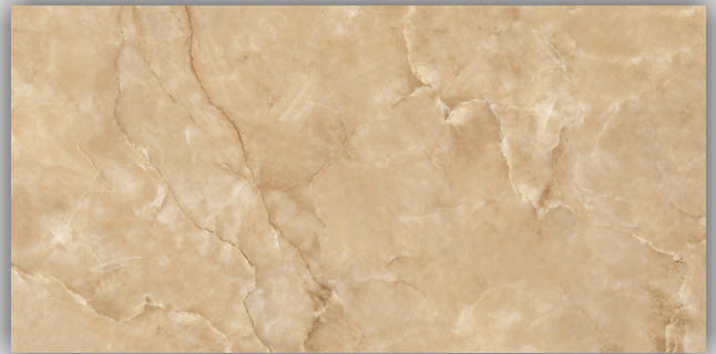
DK - 1067