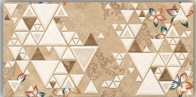
HL - 1067