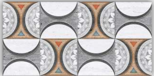
HL - 1058