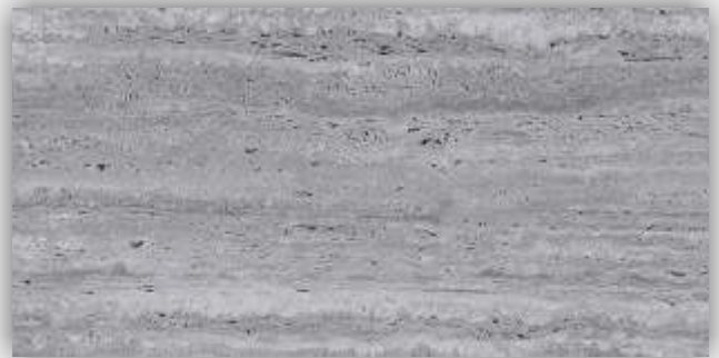
DK - 1058