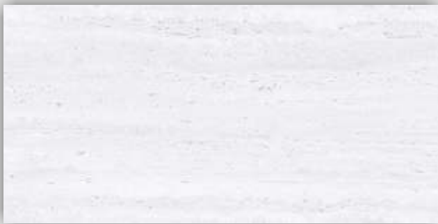
LT - 1058