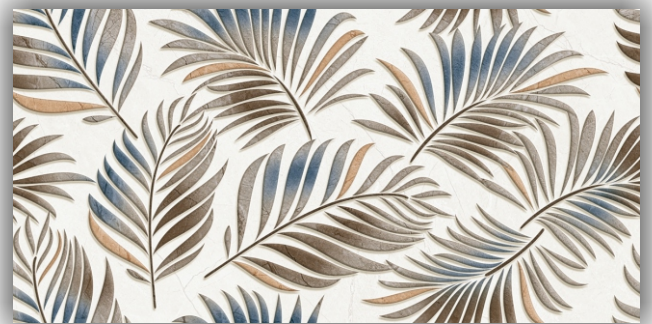
HL - 1056