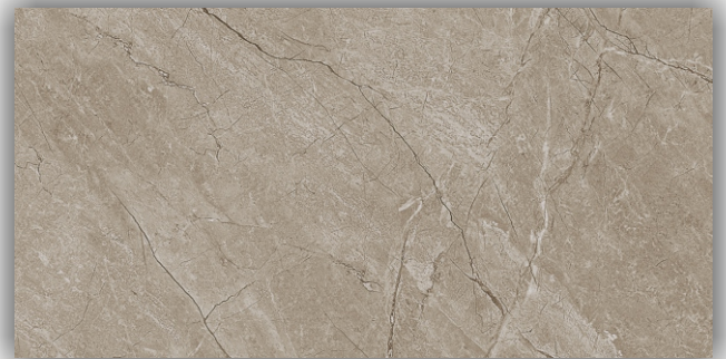
DK - 1056