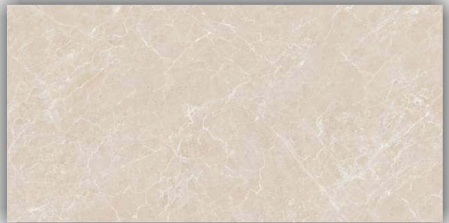
DK - 1036