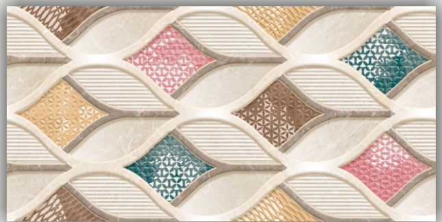
HL - 1036