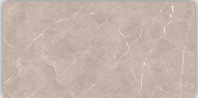
DK - 1028