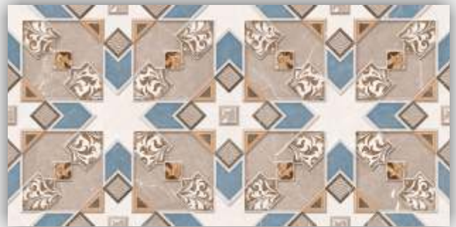
HL - 1028